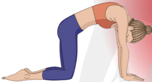
3. Cat and Cow Pose