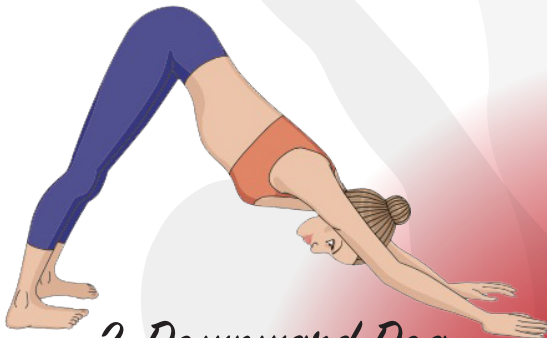
2. Downward Dog